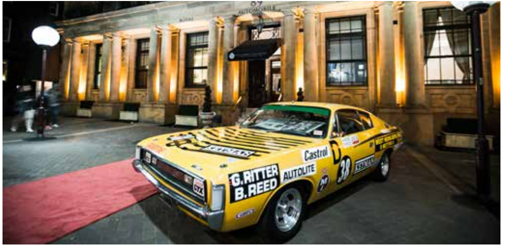
Chrysler Valiant Charger from 1971 Hardie-Ferodo 500